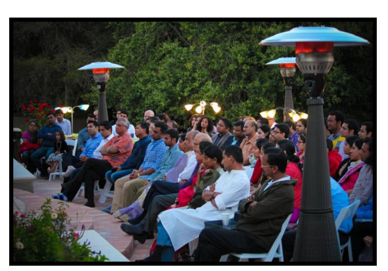
Audience sitting in rapt attention for the talk

"It really does not matter whether we are Hindus or Muslims or Jains or Sikhs or agnostics or atheists or Christians or whatever; whether we are black or white or red or yellow; whether we are male or female; we are rich or poor; death is the common equalizer. At the bathing ghat when your body becomes ashes in the ground, it does not really matter what roles you played in this earth."